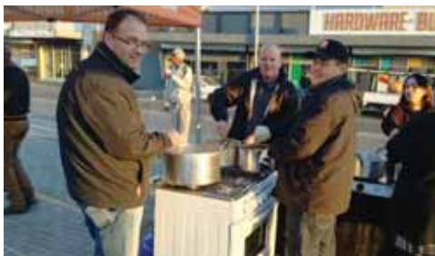
The team from BUCO, bright and early to serve some soup.

BUCO Rustenburg would like to thank their sponsors, Food Lover's Market and Twinsaver, for their contribution towards the drive and for making it possible.