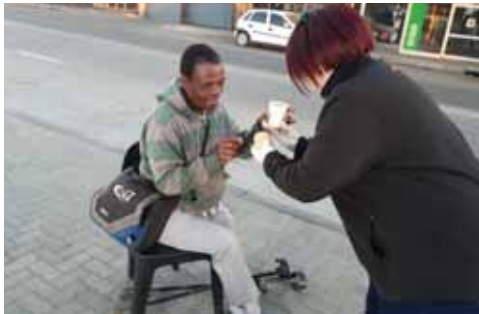
One of the passers-by receiving soup.