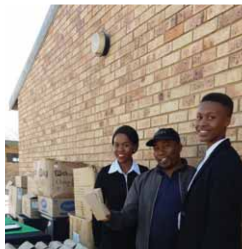
Children at Bana Pele Primary School had a day to remember.