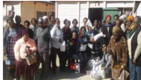
The retired nurses donated some cleaning materials for Tshupe Hospice.

If you would like to contribute to the hospice, please contact Kagiso on tshupe@telkomsa.net or 014 565 3493