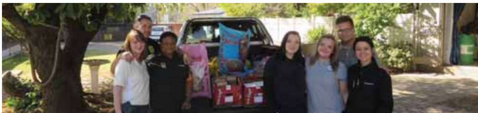
Various food parcels were handed out to Rustenburg SPCA.