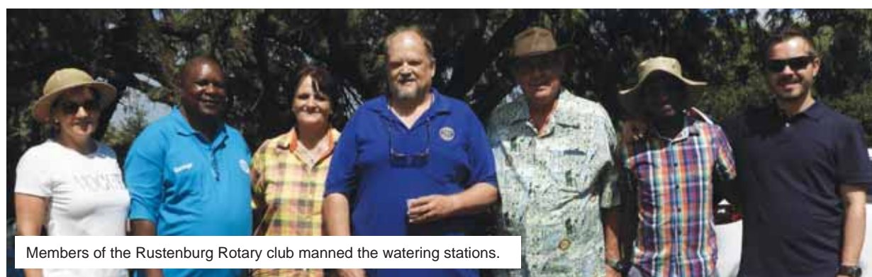
Members of the Rustenburg Rotary club manned the watering stations.