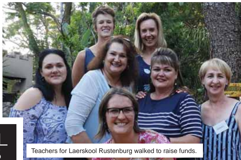
Teachers for Laerskool Rustenburg walked to raise funds.