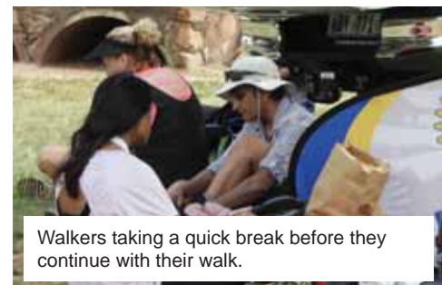
Walkers taking a quick break before they continue with their walk.