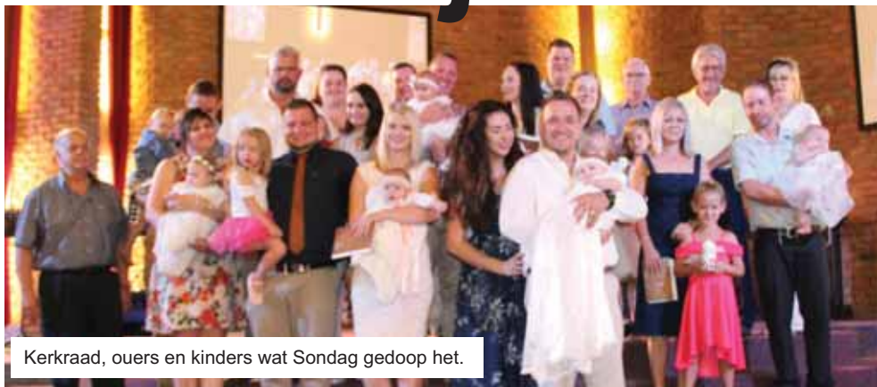
Kerkraad, ouers en kinders wat Sondag gedoop het.

Rustenburg – Die Nederduitse Gereformeerde kerk (NG) Proteapark was bevoorreg om sewe dogtertjies te doop op Sondag, 3 Maart.