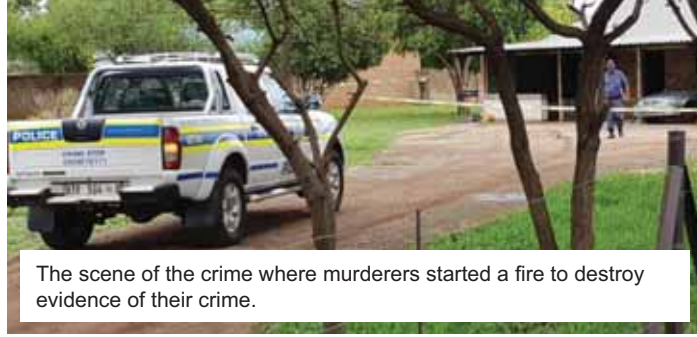
The scene of the crime where murderers started a fire to destroy evidence of their crime.