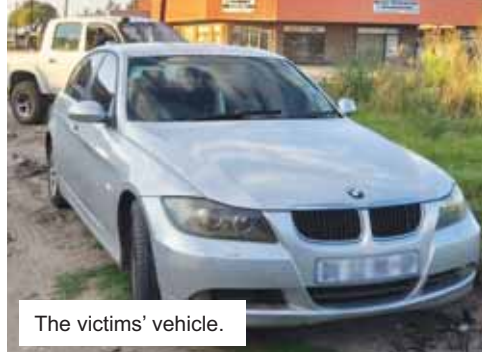
The victims' vehicle.