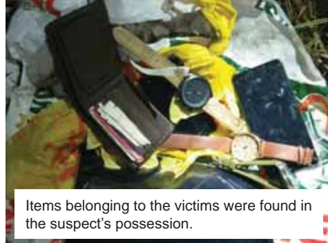
Items belonging to the victims were found in the suspect's possession.

Northam – Police made a gruesome discovery on Friday 4 January when they were summoned to an arson incident at Wildebees Laagte farm outside Northam. Two burnt bodies were discovered. It is believed that the victims were murdered and the fire was started to hide the crime.