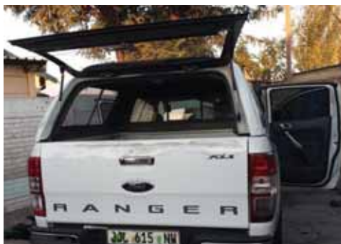
The Ford Ranger that was recovered in Meriting.

CHECK OUT THE ALL NEW PLATINUM WEEKLY WEBSITE