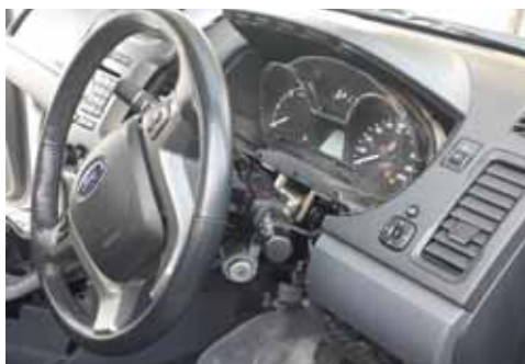
The ignition cover were removed by the suspects when they stole the vehicle.