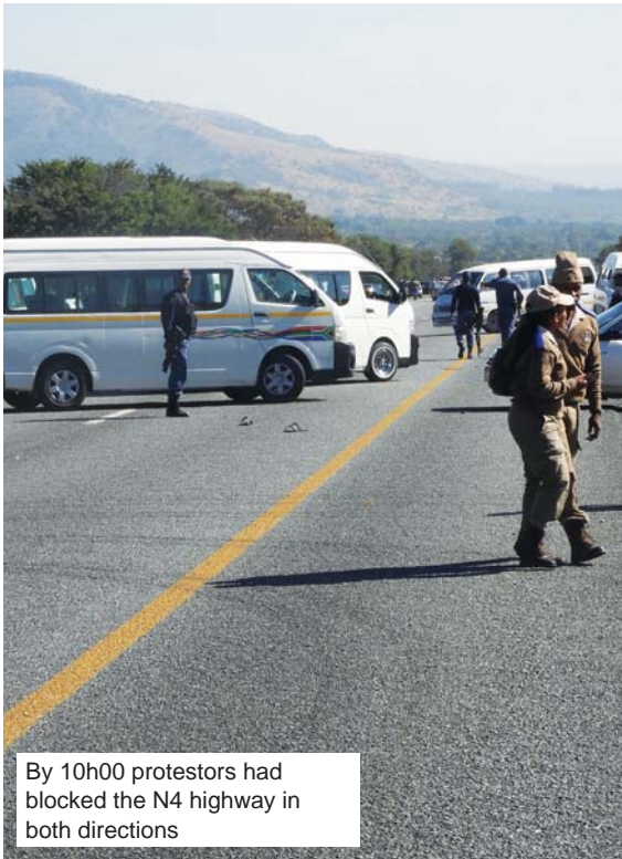
By 10h00 protestors had blocked the N4 highway in both directions