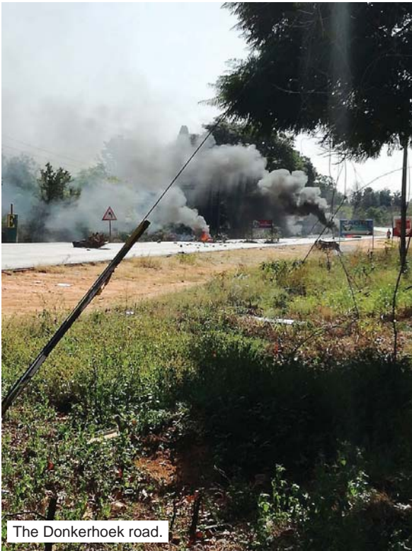
The Donkerhoek road.

explained to nearly 200 people. Tempers began to flare and the landgrabbers protested the evictions. By 10h00 protestors had blocked the N4 highway in both directions. They laid large rocks in the road and burnt tyres and shrubbery. For security reasons, police members advised vehicles to turn around and use alternative routes to prevent trucks from being torched and cars being pelted with stones, as was the case in many of the recent protests in the North West,” Augoustides said. “While several heavy-duty vehicles turned around, a group of men arrived on the scene in a quantum minibus. They ordered the drivers out of the vehicles, drove the vehicles to the middle of the road, further blocking the traffic. They fled the scene, with the keys of the vehicles before police could stop them,” Augoustides told the Platinum Weekly . While safety officers were trying to subdue the protestors, the Platinum Weekly received several reports from community members who said that the protestors were pelting vehicles with rocks and logs. The protestors also started to burn tyres and shrubbery on the Donkerhoek road, effectively cutting off all direct routes to Swartuggens, Groot Marico and Zeerust. Police arrested 10 people and impounded two Quantum minibuses. A case of destruction of property has been opened.