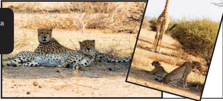
Spotted cheetah close to a giraffe.

game viewing became easier. Antelope gathered near the un-burnt areas to eat and naturally the predators followed. Cheetah were spotted at the western side of the park. “We are looking forward to the summer rains in December and hope the park will start to re-grow in the areas that were hit by the fire. Until then we hope to see more of these beautiful animals roaming around the park,” Nthangeni says. This news could not have come at a better time, since 4 December is international cheetah day – and serves as a reminder that the cheetah, like all wildlife, is a treasure of the planet and its survival depends on human conservation action. Marakele National Park is a small yet Big 5 national park situated about 12km from