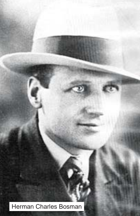
Herman Charles Bosman