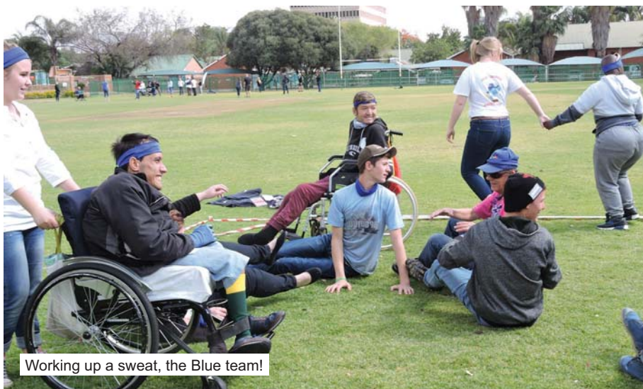
Working up a sweat, the Blue team!