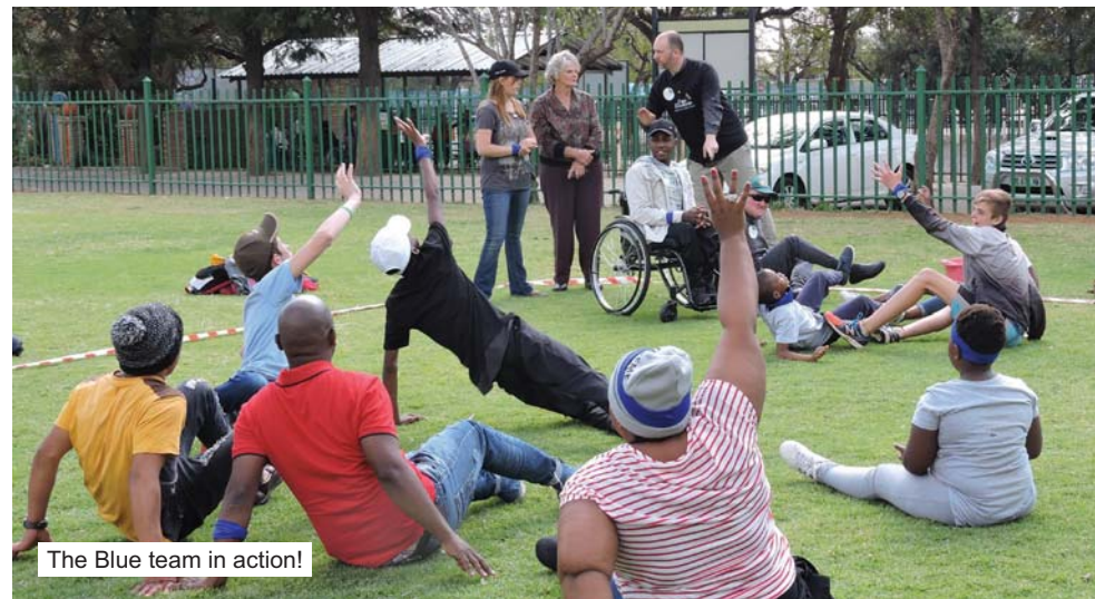
The Blue team in action!