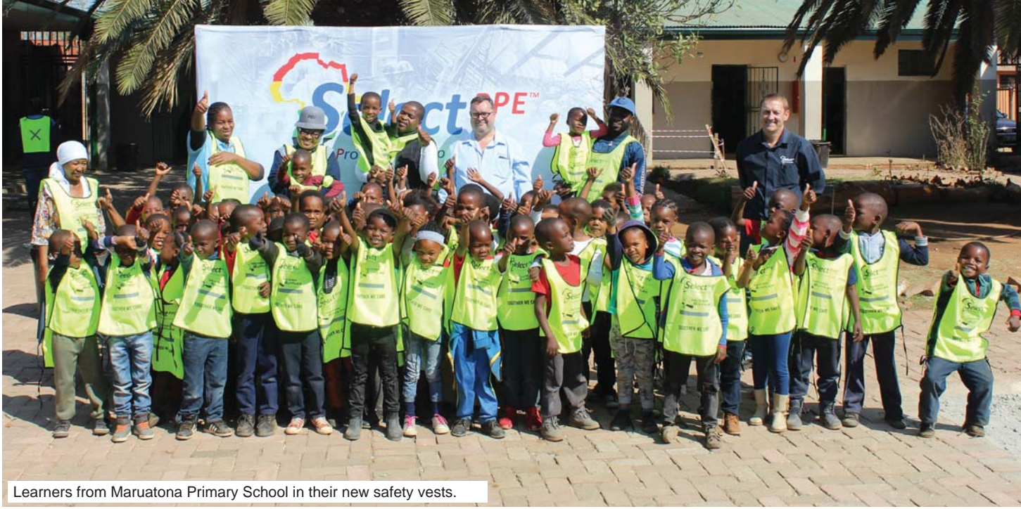
Learners from Maruatona Primary School in their new safety vests.