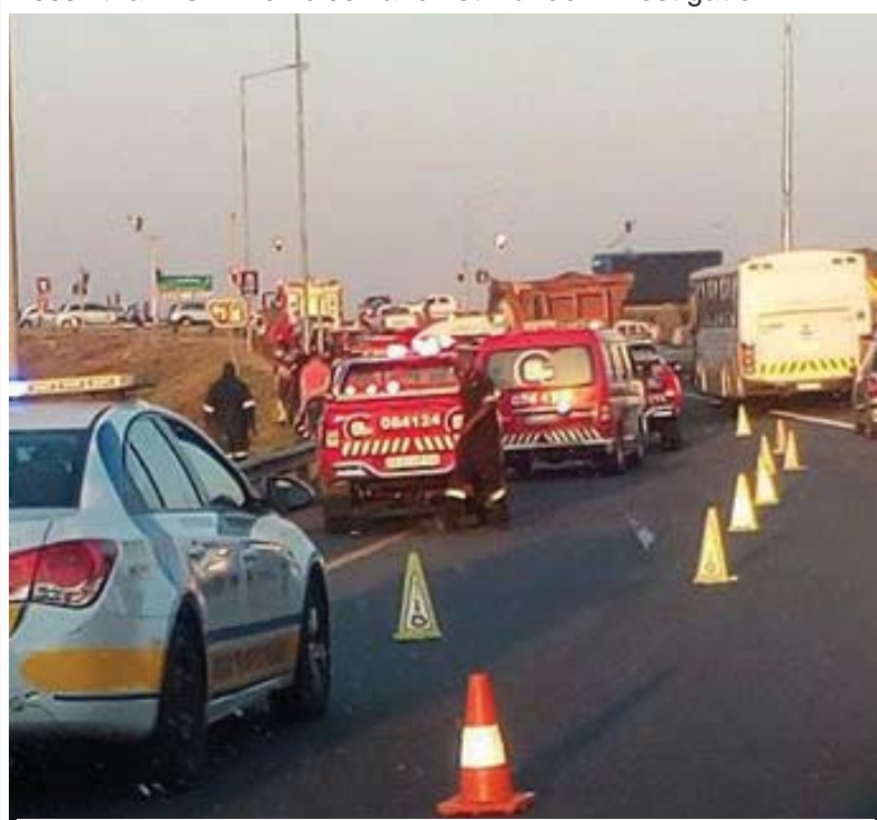
THE ACCIDENT SCENE... A truck ploughed into a number of vehicles.