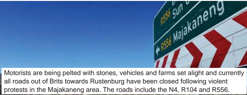
Motorists are being pelted with stones, vehicles and farms set alight and currently all roads out of Brits towards Rustenburg have been closed following violent protests in the Majakaneng area. The roads include the N4, R104 and R556.