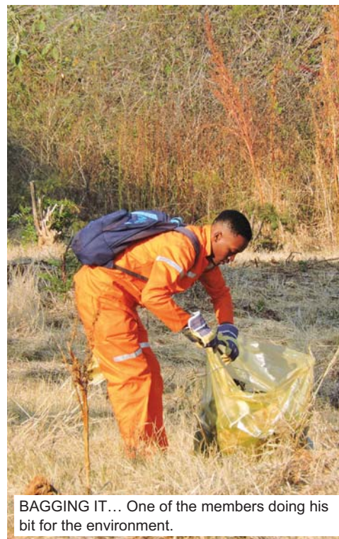
BAGGING IT... One of the members doing his bit for the environment.