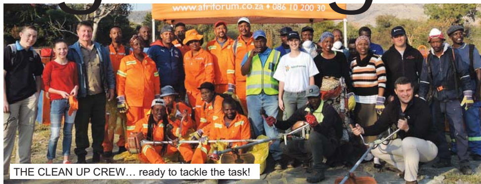
THE CLEAN UP CREW... ready to tackle the task!

The community is invited to join in the effort to keep this area clean. For more information on future clean-up dates, visit the AfriForum Rustenburg Facebook group at AfriForum Rustenburg.