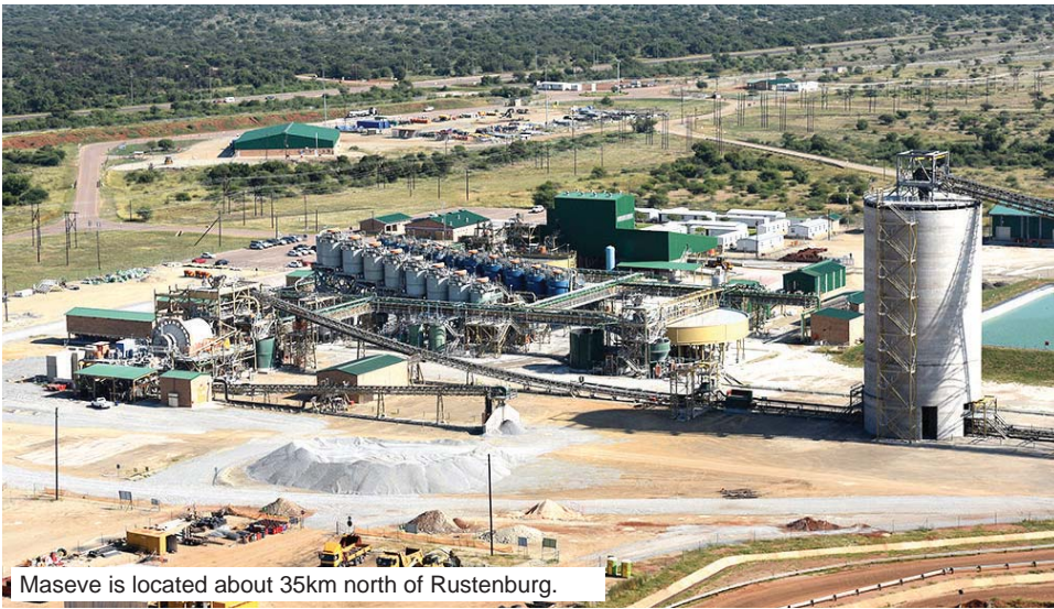
Maseve is located about 35km north of Rustenburg.

Rustenburg – Platinum Group Metals has successfully changed the operating plan at Maseve in Rustenburg and lowered its cost structure to align with a reduced production ramp up profile. Production guidance will be provided as operations commence under the new operating plan in the months ahead. Contractor terminations and consultations with labour unions have been completed in accordance with the South African Labour Act. All major contracts and union agreements have been settled and agreed promptly, in-line with the Company's budgeted plan. This has allowed for detailed manpower planning for the new mine plan