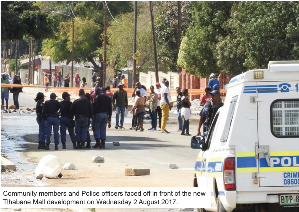
Community members and Police officers faced off in front of the new Tlhabane Mall development on Wednesday 2 August 2017.

Rustenburg/ Tlhabane – The roads next to Public Investment Corporation's development of the new Tlhabane Mall was closed off as disgruntled community members voiced their concerns on Wednesday 2 August. Boulders, rocks and even corrugated iron sheets were used to create makeshift barricades on the corner of Moumo and Motsatsi streets, as community members protested what they deemed to be a lack of transparency. Reportedly the new mall complex has been marked as a massive suburban redevelopment that will potentially see