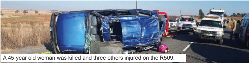
A 45-year old woman was killed and three others injured on the R509.

Rustenburg – A 45-year old woman was killed and three others injured on Monday morning, 31 July, when the vehicle they were travelling in rolled off the R509 in the Derby area outside of Rustenburg, ER24 paramedics reported. ER24 paramedics, along with other services, arrived on the scene shortly before 08h00 to find the light motor vehicle lying on its side, partially off the road. One woman was found trapped inside the vehicle. She sustained numerous injuries and showed no signs of life. Unfortunately, the woman had already succumbed to her injuries, and she was officially declared dead on scene. Three other patients were immediately assessed