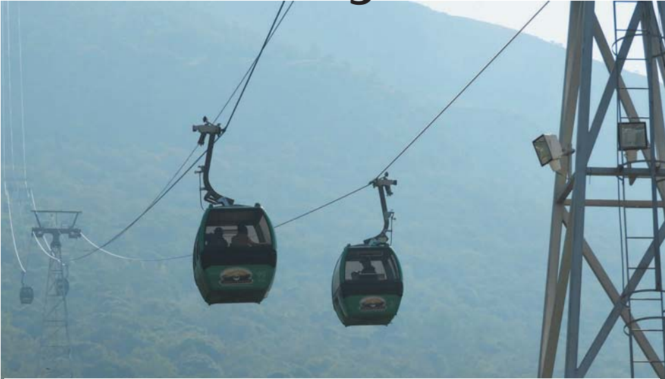
The Harties Cableway company is closed until further notice after a mechanical failure, leaving many stranded for hours, some on the mountain and some in the cable cars.

Hartbeespoort Dam – Our rescue teams safely evacuated everyone, starting with the women and children from the cable cars. They guided the guests back to the lower station, where an emergency medical station was set up,” Harties Cableway company reported. A helicopter was arranged to assist with the evacuation of visitors who were stranded on top of the mountain and 4x4 rescue vehicles were used to transport them down the mountain. No injuries or casualties were reported and the entire evacuation plan was successful. The cause of the mechanical failure will be thoroughly investigated. The cableway will remain closed until the investigation is complete.