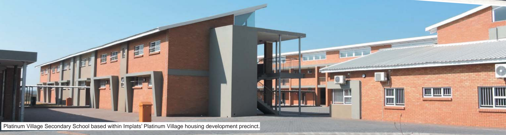
Platinum Village Secondary School based within Implats' Platinum Village housing development precinct.