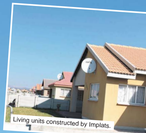
Living units constructed by Implats.