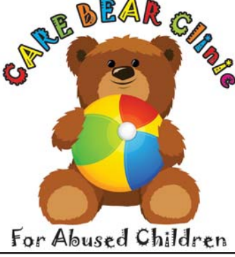
For Abused Children