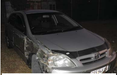
The suspect's Toyota RunX after a failed attempt at fleeing from the police.