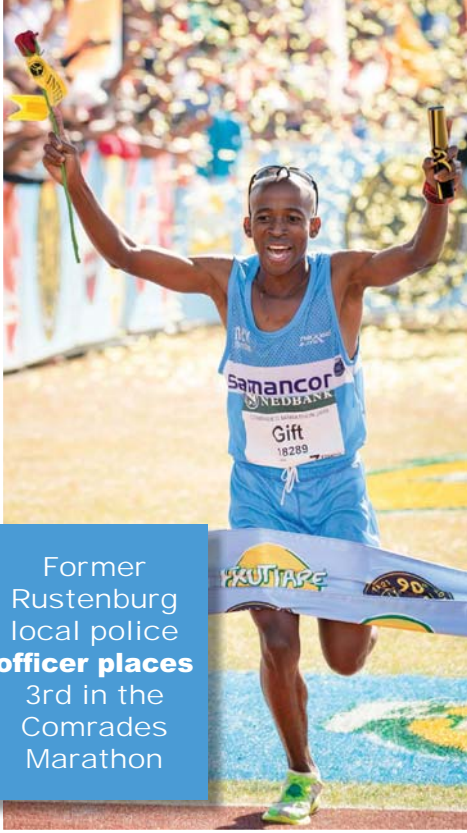
Former Rustenburg local police officer places 3rd in the Comrades Marathon